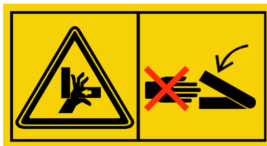
Danger of jamming fingers