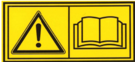
Read the manual before using the machine